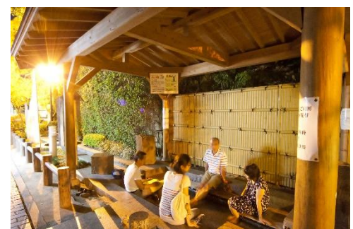
Yuda Hot Spring